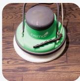
Osmo Floor Buffer + white pad