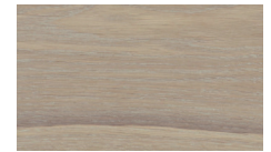
Light Grey 6118