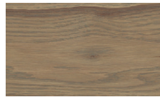
Silver Grey 6112