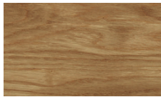
Clear Matte 6100