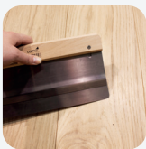
Osmo Double Blade Trowel

Finished surface in 1 day 1 coat required